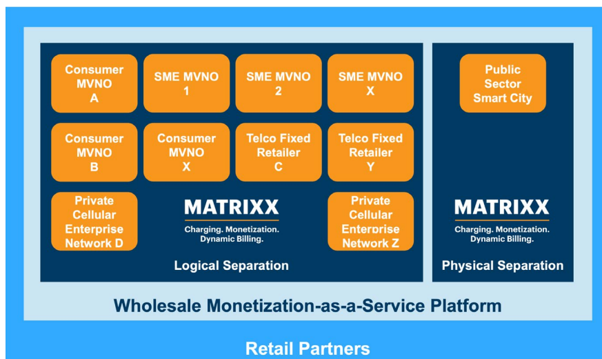
Figure 3: MATRIXXX Multi-Tenancy Flexibility, Agility and Efficiency